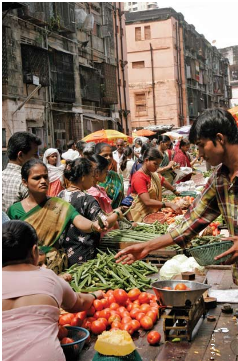
Residents of Mumbai, India, shop at an outdoor market.

Effective development assistance enables poor people to escape debilitating malnutrition, illiteracy, and disease. But the capacity of the United